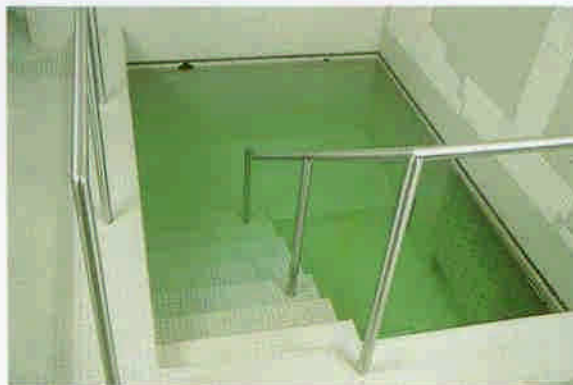
PHOTO: The mikvah pool, with its pure and natural water, is heated and kept scrupulously clean.

A Jewish wife visits the mikvah each month after her menstrual period finishes and she has counted seven "clean" days free of any menstrual discharge. The privacy of this delicate and beautiful time is ensured because these visits are made in the evening.